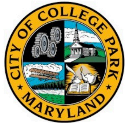
City of College Park, Maryland