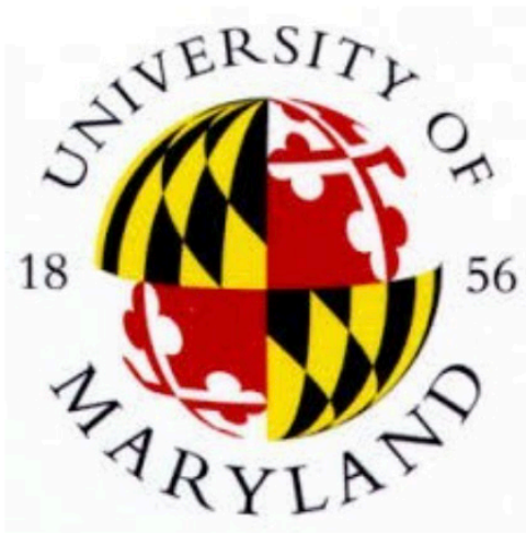
University of Maryland at College Park